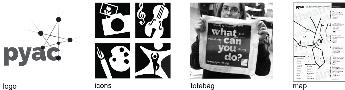
Fig. 2, visual outputs, visit the website at: www.pyac-ri.org

The primary element of the visual identity is the visual language and logo. The logo I designed represents the six members of PYAC through the use of six dots, which are connected by gradient-filled lines forming a network that expands into space to create a metaphor for idea exchange. The star suggests that their unity is greater than their individuality.