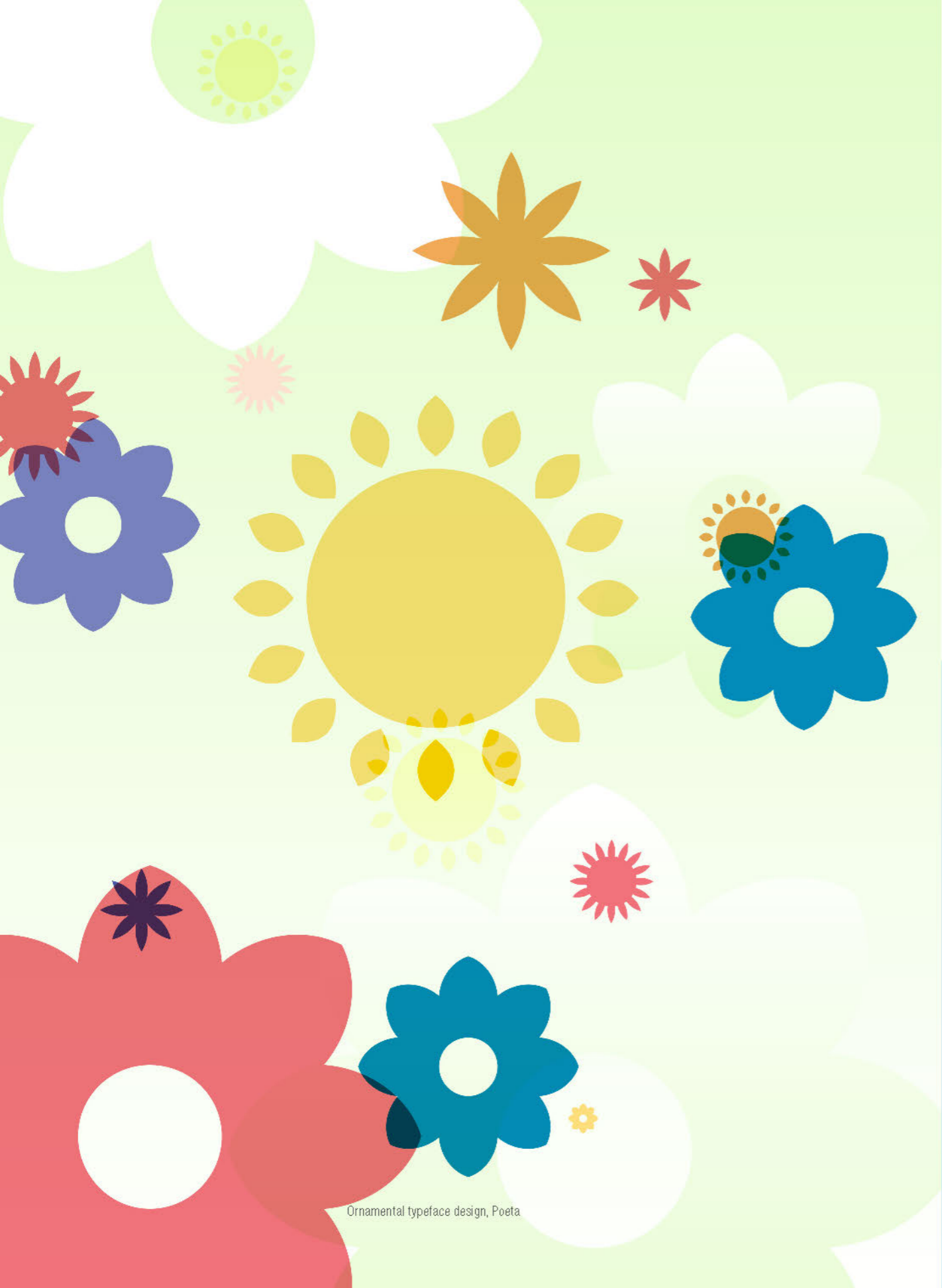
Ornamental typeface design, Poeta