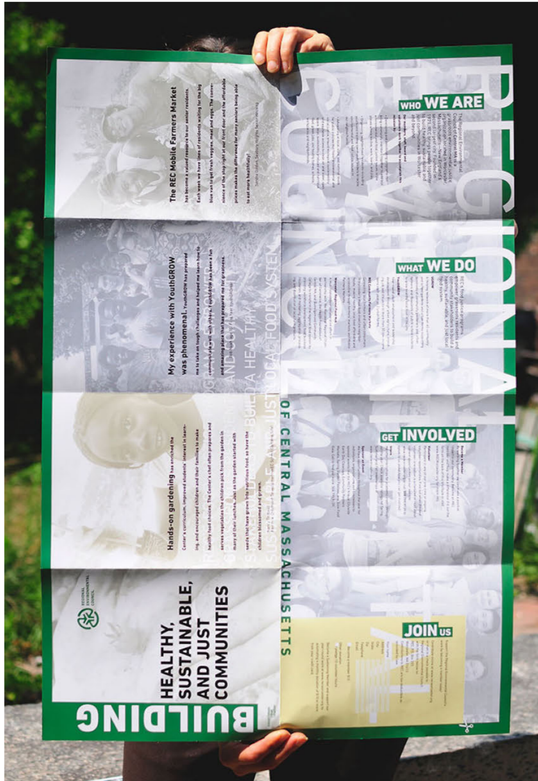
Brochure/poster for the Regional Environmental Council's food justice program Worcester, Massachusetts, USA